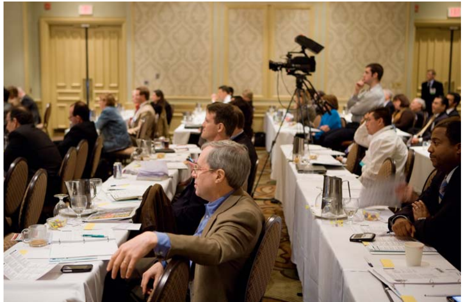
The two days in Philadelphia were filled with lively discussions and interesting lecture sessions.

As the independent disciplines of laboratory diagnostics and medical imaging are bridged through IT solutions and collaborative efforts, healthcare is moving into a new era of streamlined workflows, improved clinical outcomes, and more affordable care. Vital information from multiple sources and multiple modalities will reside in one electronic patient report accessible by all physicians along the care continuum. The result will be earlier, quicker diagnoses and improved quality of life for patients.