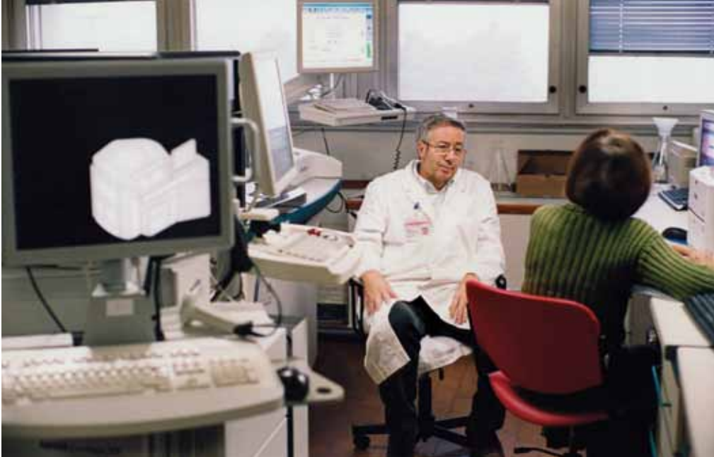
Due to the lack of space, line automation was not an option at CMEM.

the results, and provides a seven-day history of its movement," he reports. "It integrates the information from the two machines so that their results are visible in one place, on one report, as well as separately. It has reduced operator time by 43.7 percent, reduced the need for blood tubes by more than ten percent, improved speed by almost 25 percent compared to separate machine analysis, and improved our laboratory's relative productivity index (RPI) by 35.4 percent." The improved turnaround time has made doctors in and outside the hospital very happy. Patients are also happy because they don't have to give as much blood – a benefit for both the squeamish and the time-sensitive.