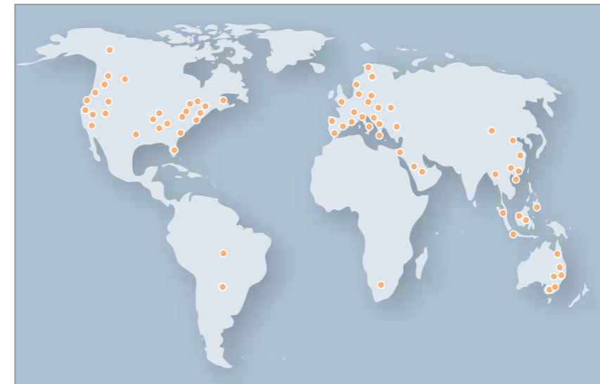
Siemens automation installations serve a wide diversity of labs around the world.

No one has more experience or expertise in laboratory automation than Siemens Healthcare Diagnostics. Our systems run millions of tests every day at labs all over the world. And they are all backed by a support staff that can help you use automation to maximize your lab's efficiency, productivity, and performance, now and in the years to come.