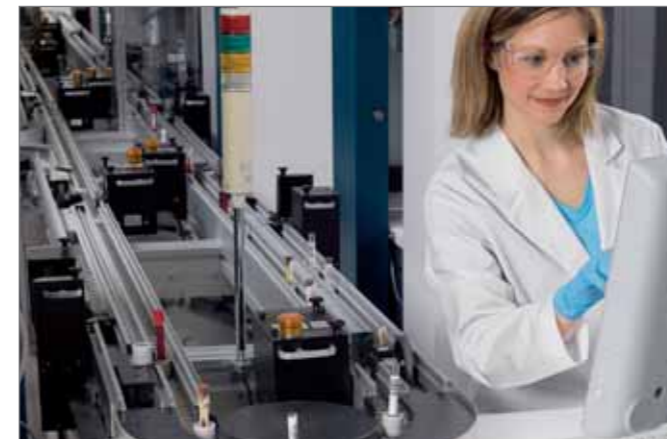
Siemens automation ensures you meet the constant demands of your clinician customers.

“ADVIA CentraLink allows you to have your skilled operators looking at the things they need to see, without wasting their time looking at dozens of things that they don’t.”