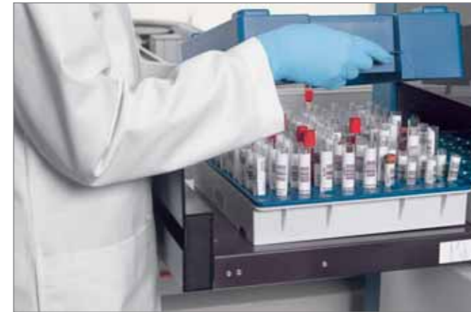
Siemens automation streamlines all aspects of your process.