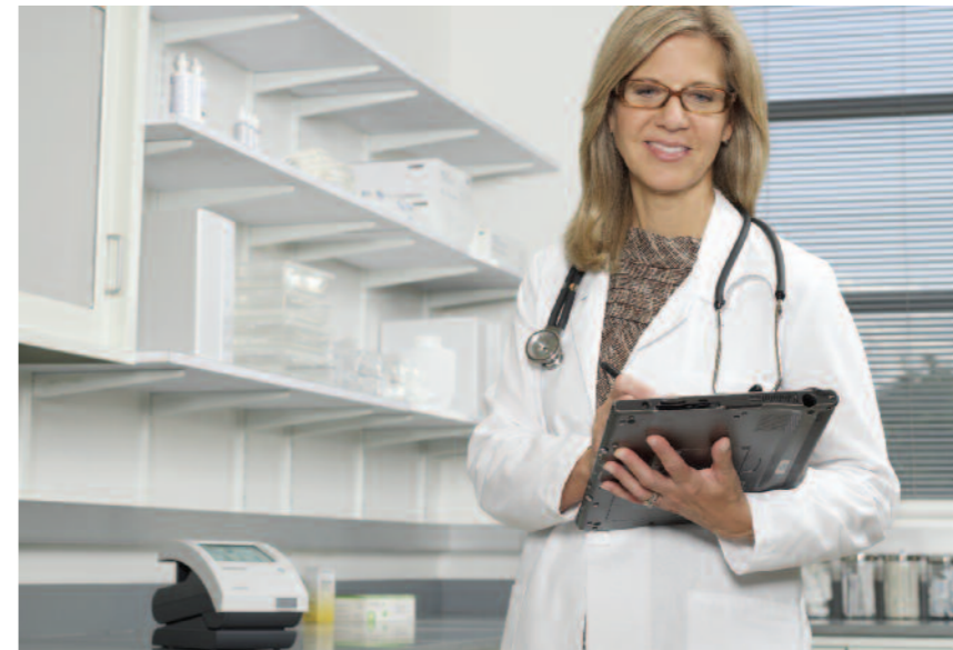
Receive urinalysis results from offsite physician's office.

Connecting to data managers provides visibility to urinalysis testing in decentralized sites