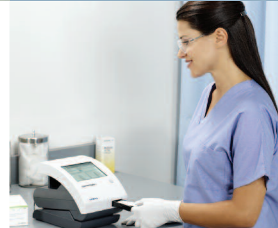
Receive hCG pregnancy tests from emergency department.