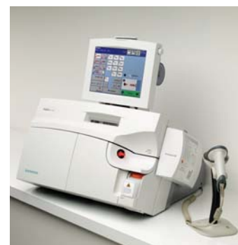
RAPIDLab® 1200 Blood Gas Analyzers are uniquely designed to meet your escalating throughput needs.