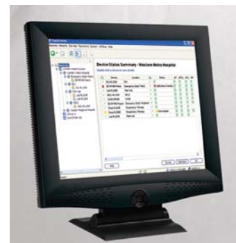
RAPIDComm Data Management Software gives you secure workstation access to all blood gas information – institution-wide.

Siemens Healthcare Diagnostics Inc. 1717 Deerfield Road Deerfield, IL 60015-0778 USA