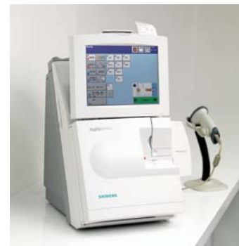
RAPIDPoint® 400/405 Blood Gas Analyzers deliver central lab accuracy with Point of Care efficiency.

Product availability may vary from country to country and is subject to varying regulatory requirements. Please contact your local representative for availability.