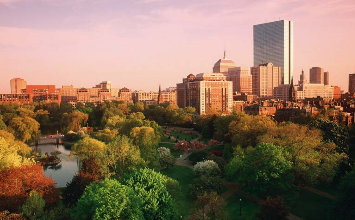
Southern Jamaica Plain Health Center, just outside Boston, runs a busy diabetes unit, performing 50 or more tests a week.

chronic disease in those communities. I started with just an idea in my head and a piece of paper in my hand—with no funding support.”