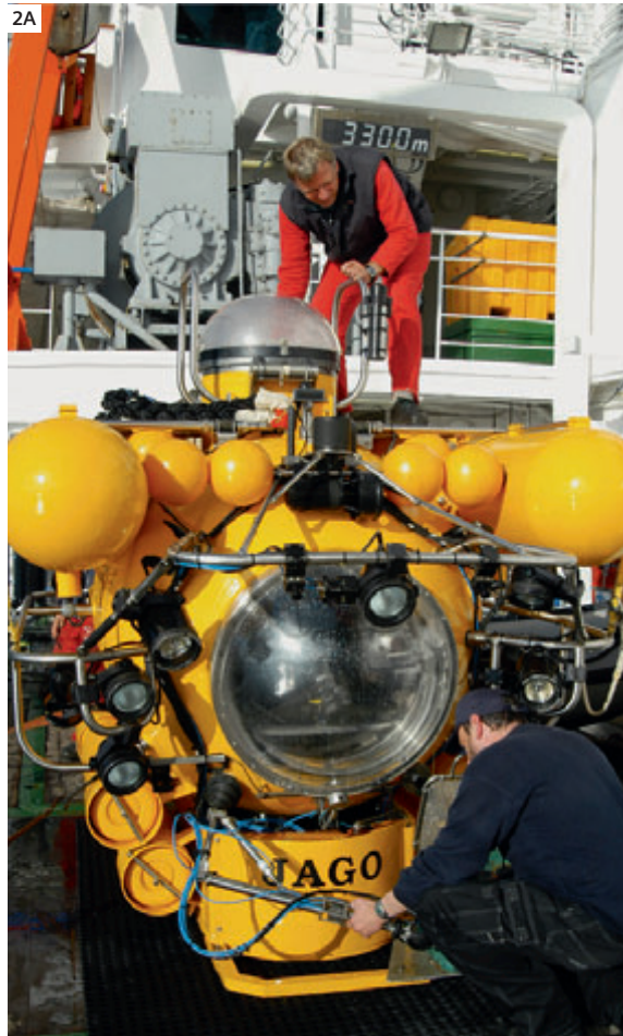
2 Oceanographic research vessel R/V Poseidon cruising the north-Norwegian Stjernesund Fjord, home to the world's most northern corals (Fig 2B). Manned submersible JAGO aboard the vessel, being prepared for a dive in the 400 m deep fjord (Fig. 2A).

Changes in coral preservation, their three-dimensional arrangement and the sedimentary structures help unravel the mound history related to past oceanographic and climatic changes. Their positions can tell, for example, if the coral colonies are still in their original life positions or were tumbled-over and transported by currents. Previously, an understanding of the third dimension had to be