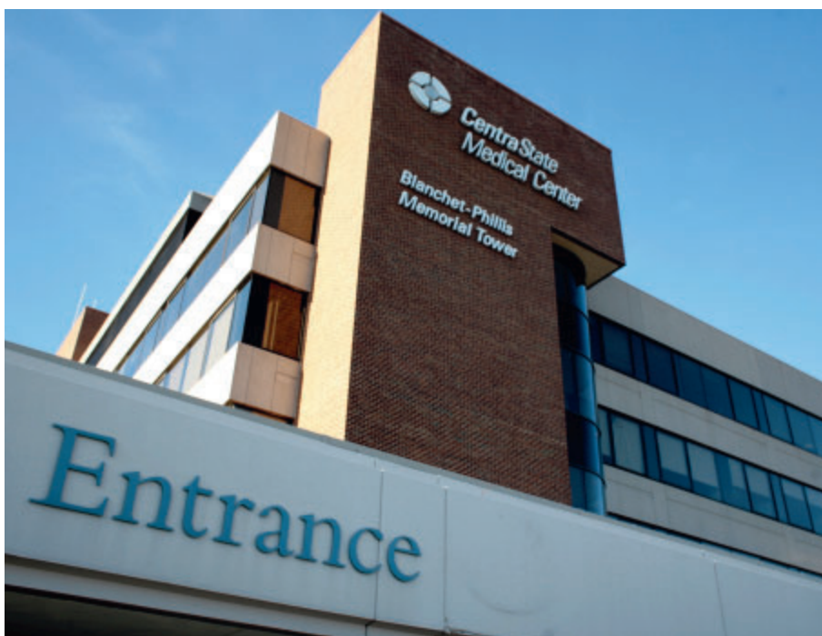
CentraState Healthcare System is a private, not-for-profit health organization founded in 1971.