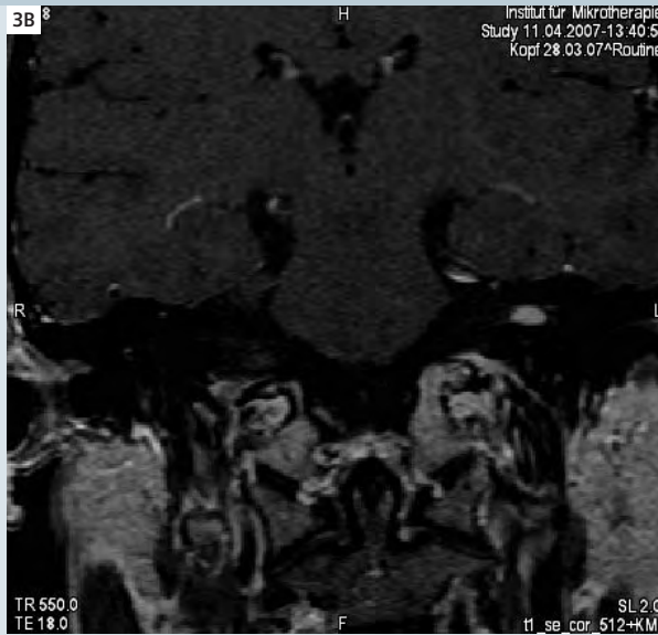
3B Coronal SE with contrast.