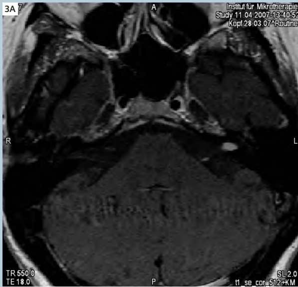
3A Axial SE with contrast.