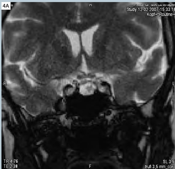
4A Coronal TrueFISP, TA = 8 s.