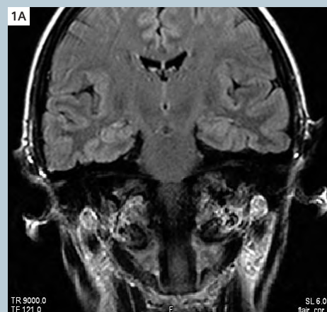
1A 6 mm coronal FLAIR.

More exact planning reduced the slices for 3D CISS from 56 to 36. As a result, resolution could be increased from 256 to 384 while the slice thickness was reduced from 0.8 to 0.7. This means that we saved nearly one minute on scan time.