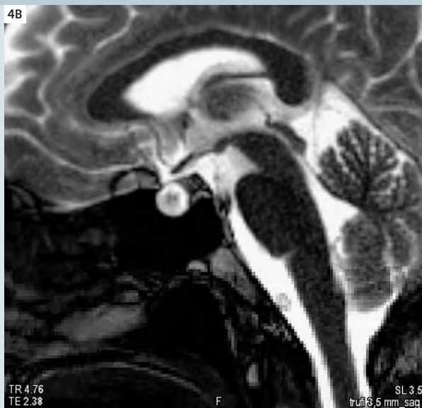
4B Sagittal TrueFISP, TA = 9 s.

For the T1-weighted measurement, we were able to reduce the slice thickness from 3 to 2 mm, increasing the image quality at the same time.