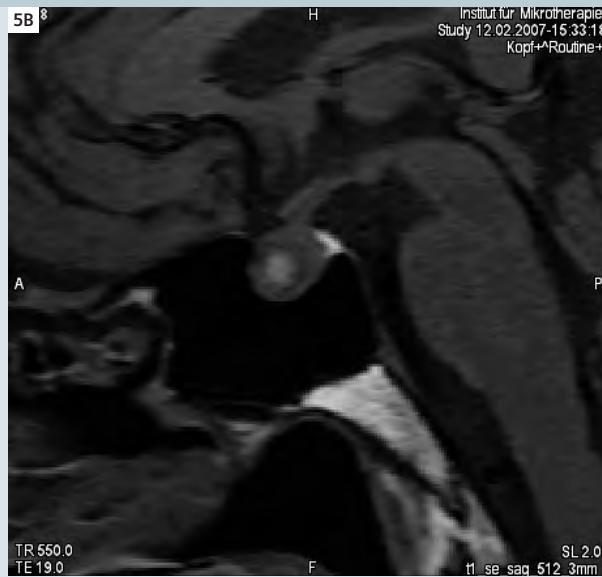
5B Sagittal SE, TA = 5:25 min.