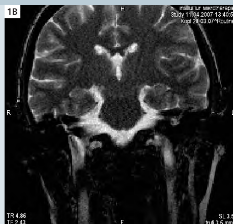
1B 3.5 mm coronal TrueFISP.