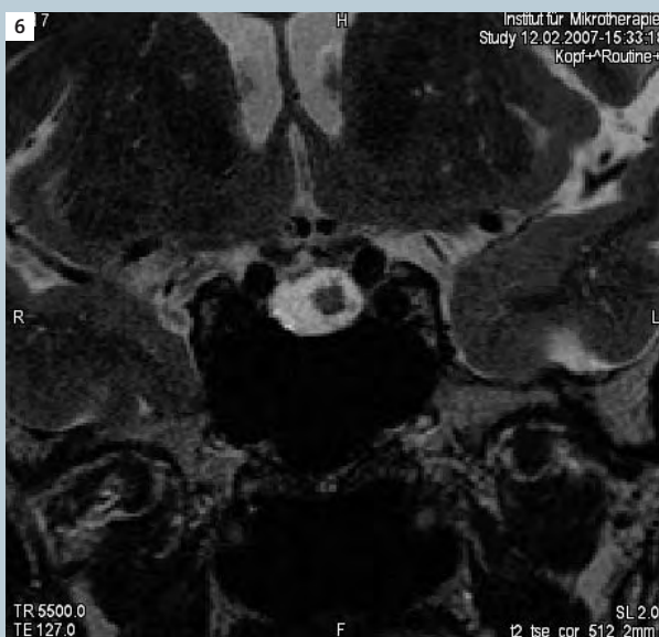
6 Coronal T2-weighted TSE, TA = 3:25 min.