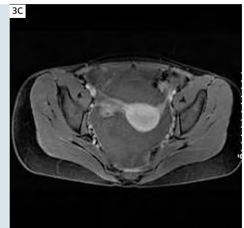
3C Contrast uptake of the large ligament and of the right adnexal, in contact with peritoneal abortion of ectopic conception material.