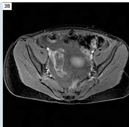
3B Transverse VIBE late post contrast: ring enhancement of the expulsion material, showing a tubo-ovarian bleeding.