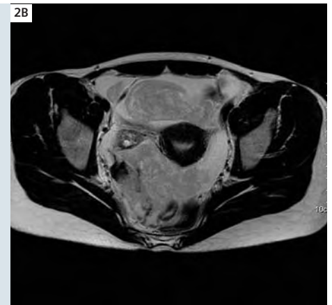
2B Transverse T2-weighted tse with syngo BLADE: hemoperitoneum, right adnexal, round ligament, large ligament and posterior part of the mass.