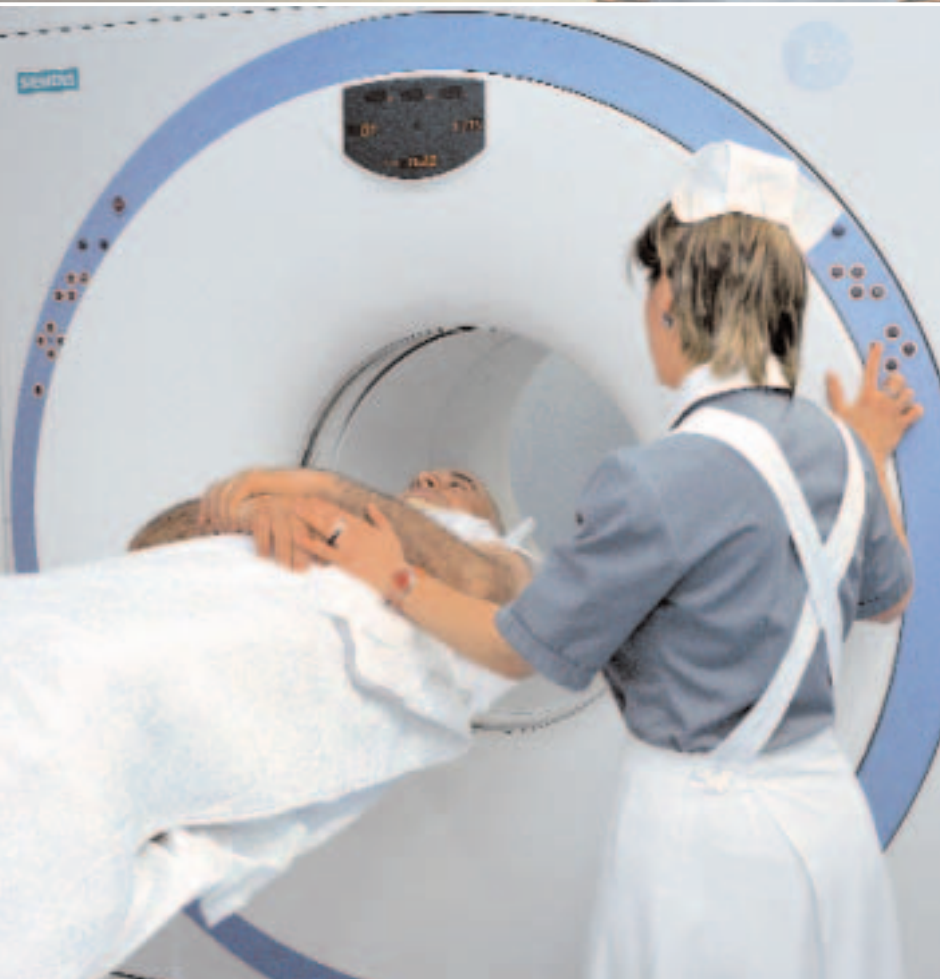
THE ONCOR IMPRESSION PLUS LINEAR ACCELERATOR is the latest technological investment at the oncology department (above). A patient is scanned with a biograph 2 PET/CT system (below).