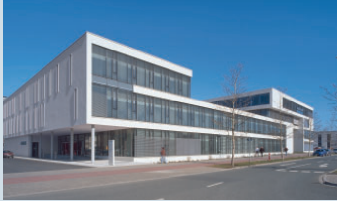
The Siemens Training and Development Center in Cary (left) opened in 1992. In 2006, Siemens built a new Training Center in Erlangen.