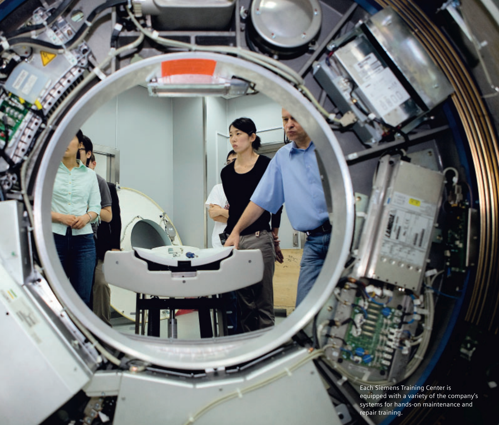
Each Siemens Training Center is equipped with a variety of the company's systems for hands-on maintenance and repair training.

The courses help Siemens customers deepen their understanding of extremely sophisticated, state-of-the-art medical equipment such as the company's magnetic resonance imaging (MRI) and CT scanners, or radiography, fluorography, and angiography systems. That in turn empowers them to optimize workflows, avoid and detect operational errors, and fully utilize their equipment's potential. This improves examination results and increases patient care and satisfaction.