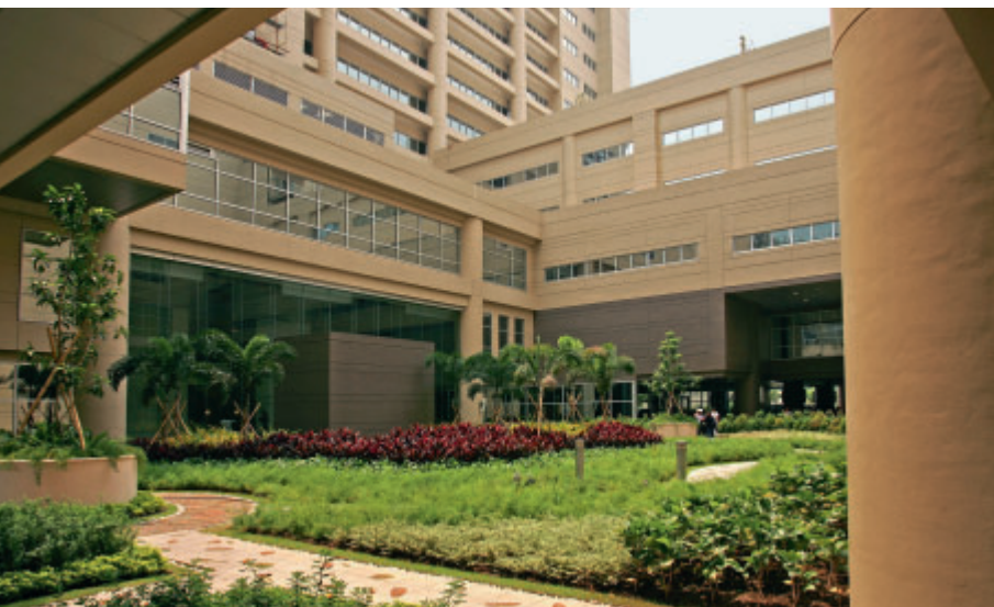
The Medical City Hospital in Manila, Philippines, a private, tertiary care hospital, serves some 40,000 inpatients and 380,000 outpatients a year.

It is, in fact, the synergy that develops between education and service that further helps to better diagnose and correct any issues that may arise. A basic course in CT, for instance, enables operators to benefit from Siemens service support even more than usual. While today, based on the service agreement, many system malfunctions can be solved remotely via Siemens Remote Service (SRS), some system malfunctions require onsite support by a trained