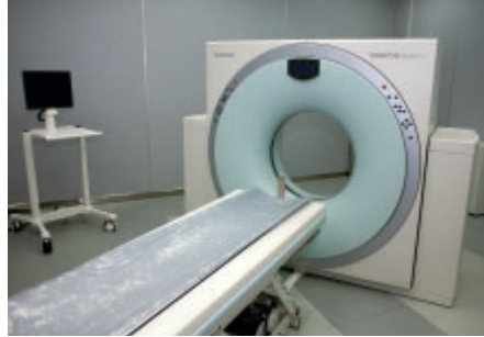
Only a few steps separate the classrooms from the imaging systems.