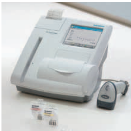
DCA Vantage analyzer

strategy with the patient – all in less than 30 minutes. Without the DCA Vantage analyzer, the patient's blood and urine would have to be sent to a central laboratory for testing. Allowing for possible time delays, for example, if the patient cannot be reached immediately by phone, the whole procedure would take a great deal longer than the point-of-care test.