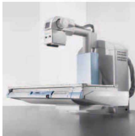
AXIOM Luminos dRF

ment of Medical Imaging at ZOL, the number of examination rooms for general X-ray has been cut in half and cassette acquisitions were reduced to a minimum. A financial evaluation at ZOL estimates the average savings per year to be 25 percent.