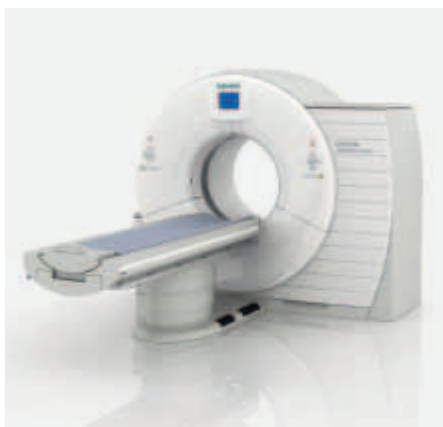
SOMATOM Definition Flash

beta-blockers, for example, around one hour per patient can be saved. Moreover, it lowers the radiation dose below the natural background radiation, making this noninvasive method accessible to more patients – increasing the number of referrals. In addition, with the fast speed of SOMATOM Definition Flash, it is possible to perform a one-stop-examination. This can save up to 15 percent of costs and 15 hours in time per patient, avoiding multiple expensive diagnostic tests. SOMATOM Emotion, as another example, has now been installed more than 6,000 times worldwide and has proven that it is a true routine workhorse when it comes to excellent image quality in combination with fast workflow and reduced total cost of ownership. Finally, with SOMATOM Spirit, Siemens offers a reasonably priced system for those who wish to expand their offerings to include CT imaging in spite of the crisis.