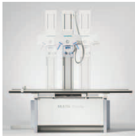
MULTIX Swing with mFD