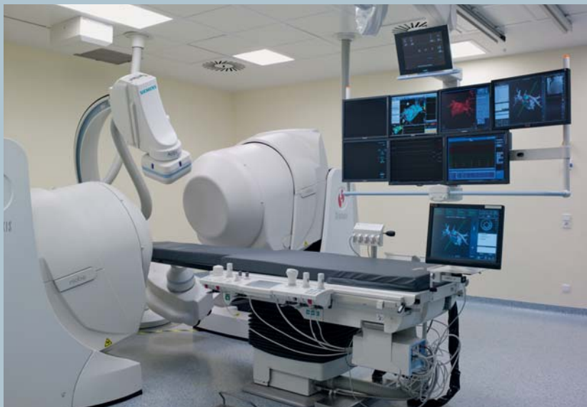
The Artis zee Magnetic Navigation system is used for reconstructive heart procedures at the Marienhaus Klinikum St. Elisabeth in Germany.