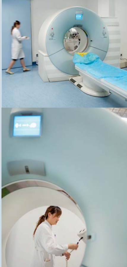
The CT scanners are in operation from eight in the morning until nine in the evening.

of TubeGuard. And this was exactly the case: In the following days, we actually had problems with the tube, and ten days after the end of the time limit, the emitter had a complete breakdown, as predicted. We were pleased – and convinced that TubeGuard worked. Brilliant!” TubeGuard means tangible benefits for the institute. “We have a significantly smaller risk of unscheduled downtime,” says Xu. “This means that we do not need to disrupt our schedule for repair work. If Siemens gives us a call today and predicts that one particular tube will break within the next few days, we can have a Siemens engineer come over that very evening. He can change the tube outside of our regular working hours. The next morning, we just continue our work with our patients. Nobody needs to wait.” Avoiding disruptions of the clinical workflow is important for every medical service provider. It is especially significant for a facility like the Shandong Medical Imaging Research Institute and its CT department, because of the high percentage of outpatients among the people in Xu’s care. They come from all parts of