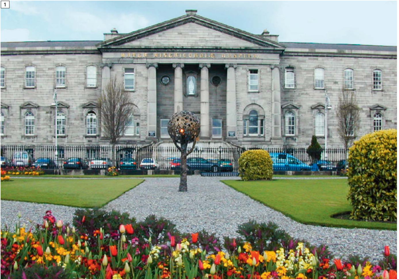
The Mater Misericordiae University Hospital (MMUH) in Dublin, Ireland