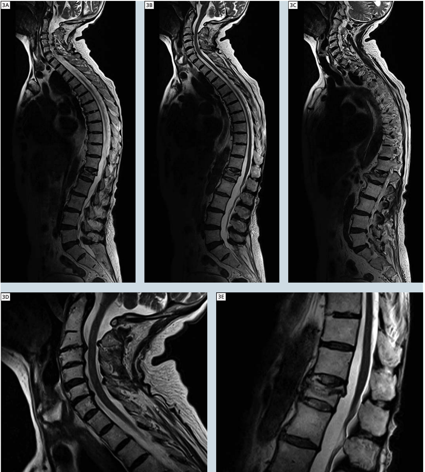
3 Example of a whole-spine exam. 3A–C composed sagittal T2w TSE images, consisting of three stages (TR / TE = 4000 / 100 ms; slice thickness 3 mm). Note the slight scoliosis (best shown in 3C ). Magnified images do demonstrate multiple degenerative changes of the cervical spine with narrowing of the spinal canal ( 3D ) and the compression fracture of the first lumbar spine without relevant stenoses of the canal ( 3E ).