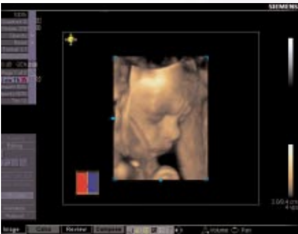
fourSight 4D imaging—fetal face