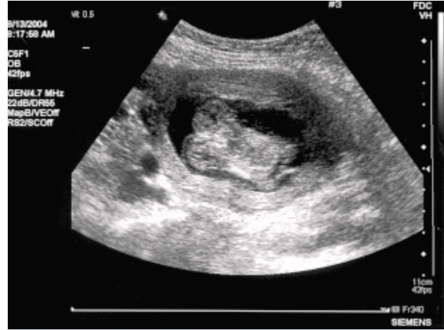
[2] 2D ultrasound image suggesting conjoined twins.