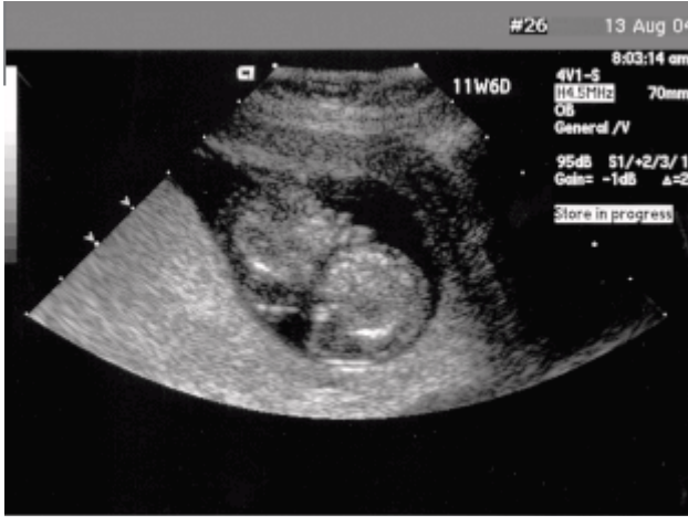
[1] 11.6 week transverse view monoamniotic twin, with increased nuchal translucency.