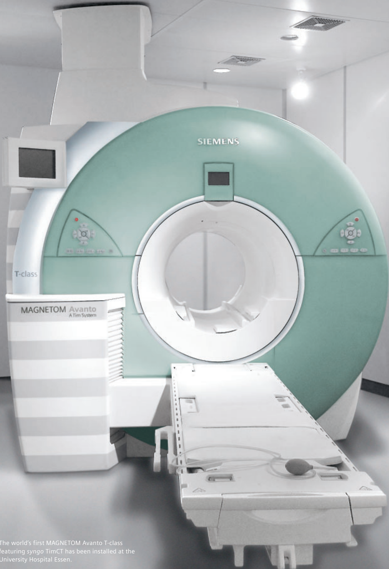
The world's first MAGNETOM Avanto T-class featuring syngo TimCT has been installed at the University Hospital Essen.