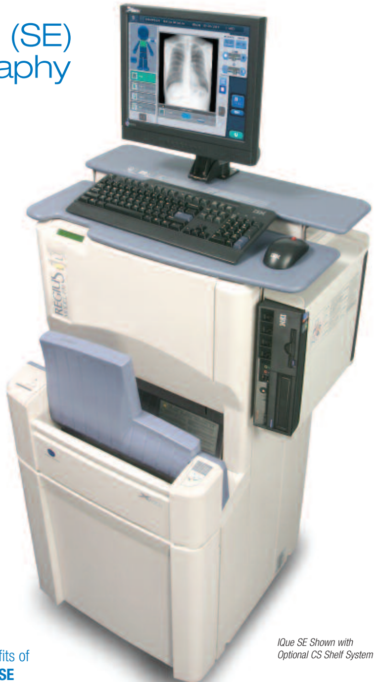
IQue SE Shown with Optional CS Shelf System

Ask your Konica Minolta representative about the benefits of "Going Digital" with the intelligent, simple to use IQue SE